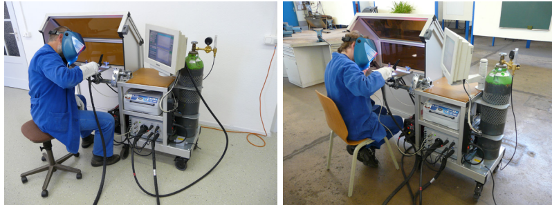
Overall view of the welding trainer

Computer-aided training in TIG, MAG and MMAW welding