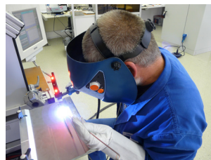
TIG welding simulation on the welding trainer