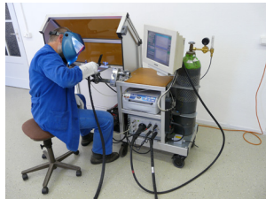
MAG welding simulation on the welding trainer